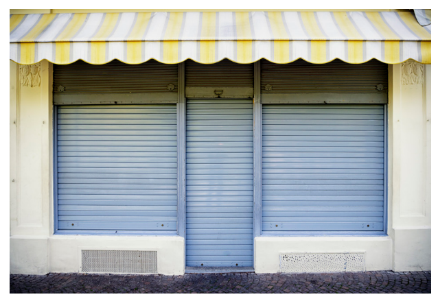
Plywood (top) should only be used as a last-minute alternative, while roll-down shutters (bottom) are the easiest to activate.

To determine the best option for your facility, consider the following questions regarding advanced deployment: