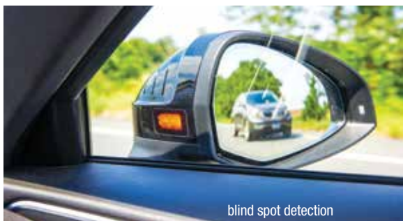
blind spot detection