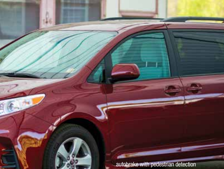
autobrake with pedestrian detection